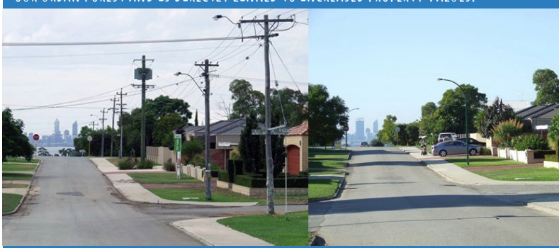
Example of a Perth street before and after underground power.

UNDERGROUND POWER HAS MANY BENEFITS INCLUDING A MORE RELIABLE ELECTRICITY SUPPLY WITH LESS POWER OUTAGES, IMPROVED SAFETY, ALLOWS FOR THE PLANTING OF OUR URBAN FOREST AND IS DIRECTLY LINKED TO INCREASED PROPERTY VALUES.