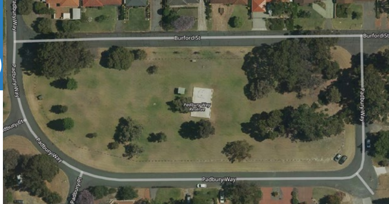
Aerial photo of Padbury Way Reserve above. Funds have been allocated and residents will be invited to reimagine this open space.

Thanks to everyone who attended the Eden Hill "Mobile Ideas Hub" and contributed ideas to shape the future of your local neighbourhood. We've been gathering the community's thoughts to understand what kind of place you want your